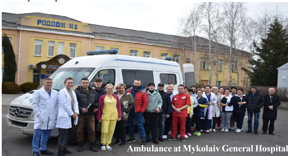
Ambulance at Mykolaiv General Hospital