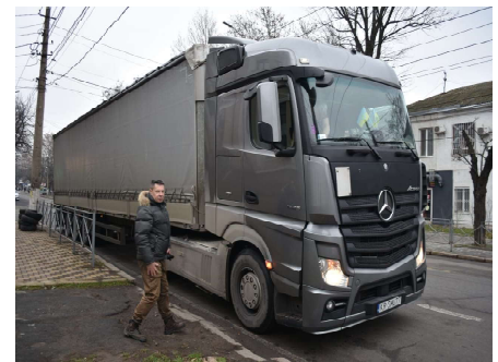
Truck delivering food in Mykolaiv