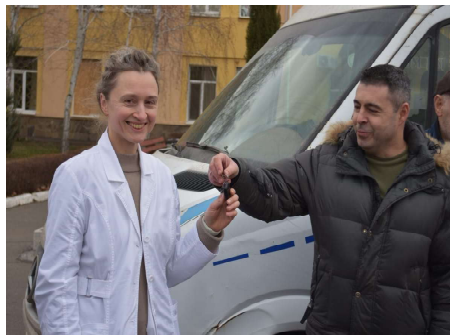
Handing over keys