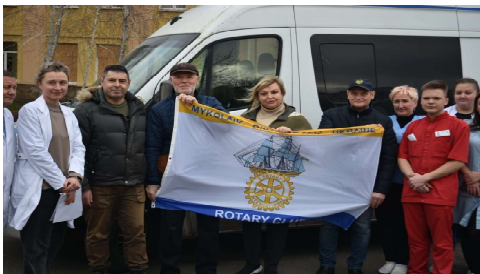
Mykolaiv partner with ambulance